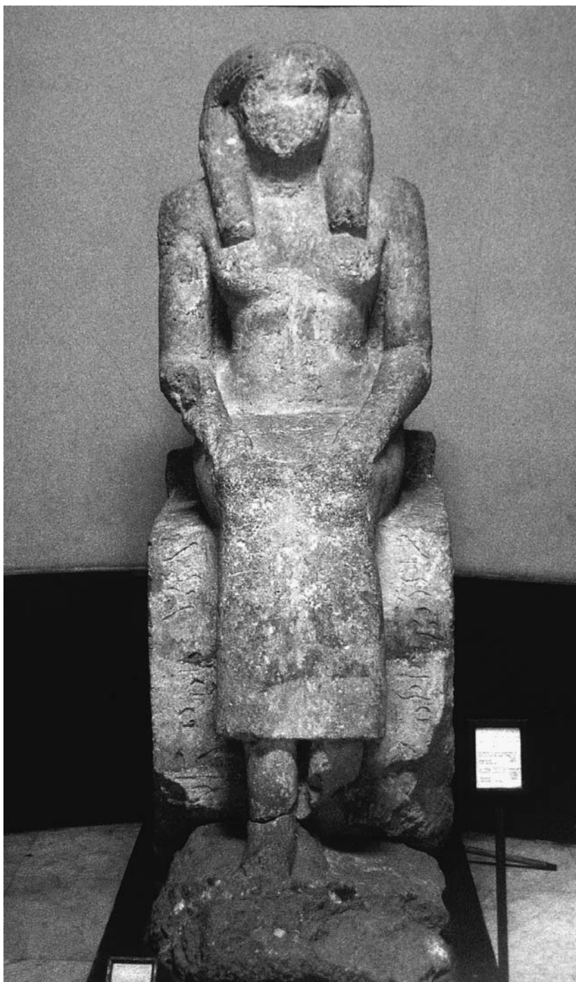
Fig. 1a. Frontal view of Khamererneby I, Egyptian Museum, Cairo no. 48856.