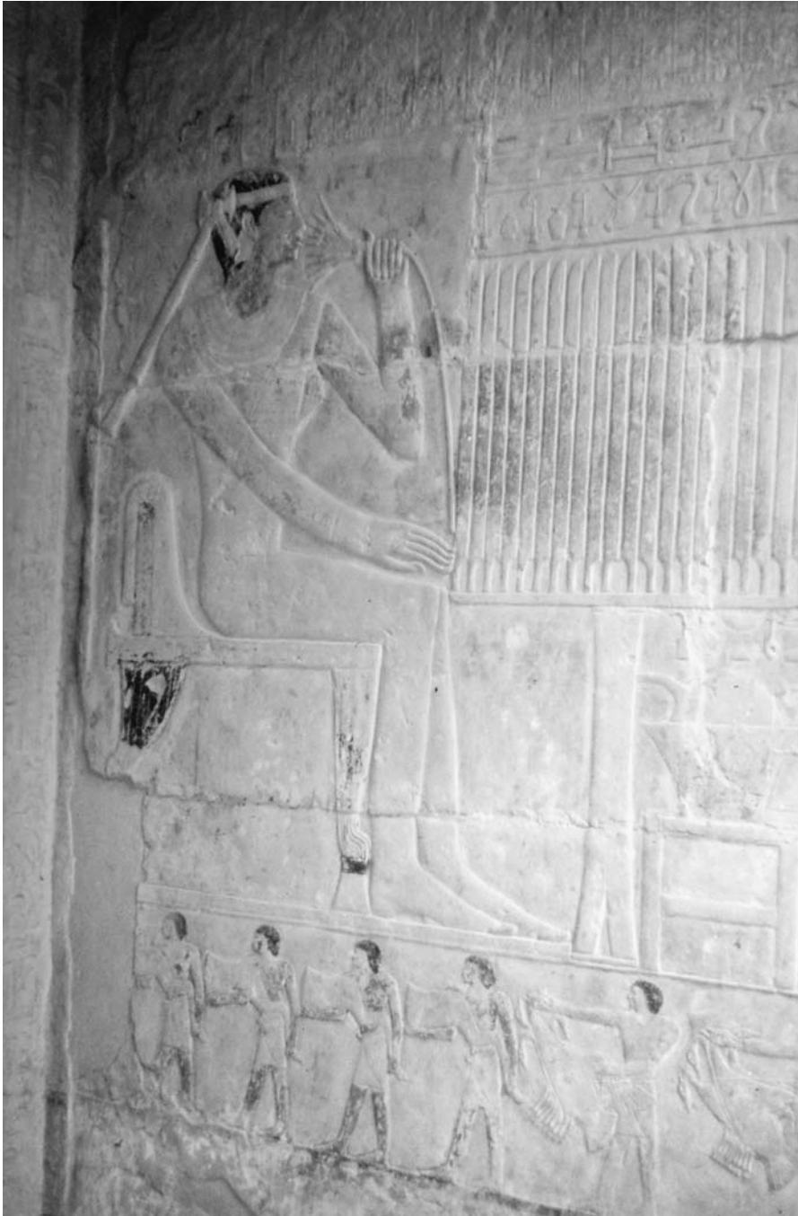
Fig. 4. Princess Watetkhethor, tomb of Mereruka, Saqqara.