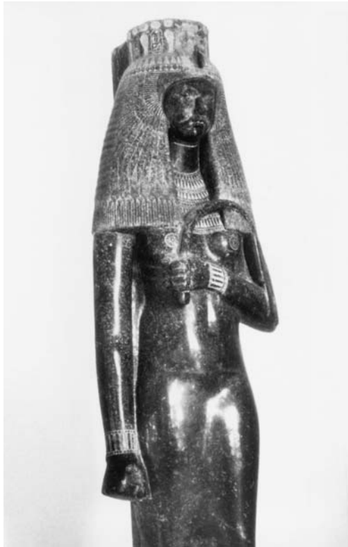
Fig. 3. Queen Tuya, wife of Seti I, Museo Gregoriano Egizio, Vatican inv. no. 22678.

Beginning in the Middle Kingdom, the cloaked male figure, and in particular the "cube" statue of the seated male with his knees drawn up close to his chin, retained popularity for centuries. The well-dressed official of the New Kingdom often appeared as a seated scribe, with head bent over his scroll to emphasize his literacy even if he followed a military career. Such closed, quiet, even "monoidal" renditions of elite Egyptian men contrast sharply with the sensual portrayals of their women. Although there are many New Kingdom elite women who are shown in the art with layered clothing, usually it is not permitted to obscure their figures. 45