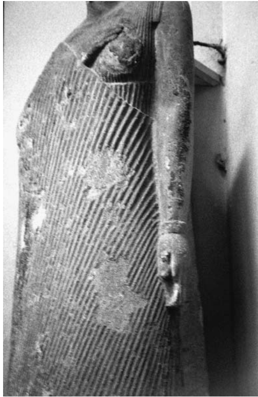
Fig. 2b. Side view of Khamerernebt II, no. 48828.

Khamerernebt here assumes normal proportions and size, (the statue measures today 1 m. 34 cm, minus head and feet) but is unusual for the elaborate garb she wears. She is enveloped in a pleated tunic fixed at the shoulders with straps and ties, and a cloak which has been draped sari-like, over one shoulder. The outline of her right arm is seen beneath this cloak, as it extends across her chest with the hand resting above her left breast (a pose seen frequently in the depictions of elite women in contemporaneous tombs like Mersyankh's). 37 Her left arm hangs straight down at her side and is decorated with a bracelet, and her left foot is slightly advanced. Her skirt is not long, ending well above her ankles. There is a narrow plinth behind the lower half of this otherwise free-standing figure, which left only a slender neck to support the head—doubtless why it broke off long ago. With the head missing, it would be difficult to identify this image as one of a woman were it not for the exposed left breast. Indeed, it would seem the artist resorted to this device in order to identify his subject as female more clearly.