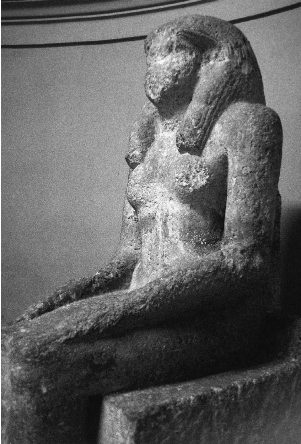
Fig. 1b. Side view of Khamerernebt II, no. 48856.