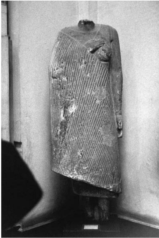
Fig. 2a. Frontal view of Khamerernebt II, Egyptian Museum, Cairo no. 48828.